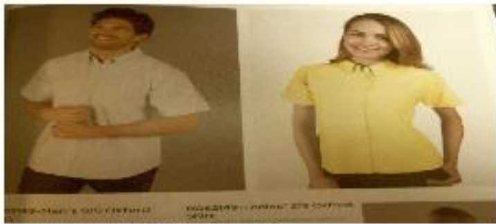
Above: Oxford Shirts